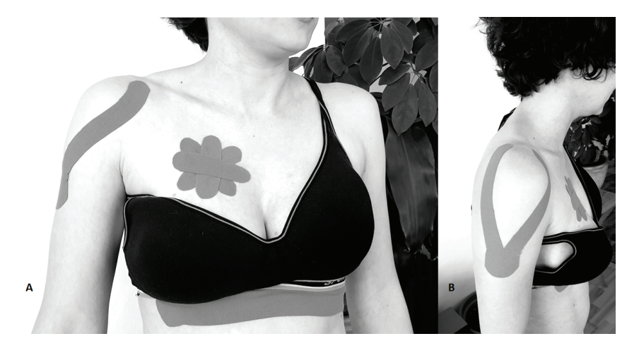
Fig. 2. Applications used in the study group by Imperatori et al. recreated by the authors on a model: A. Application used for the trigger point and the diaphragm; B. Application for the deltoid muscle

therapy following standard pain management procedure for surgery-related pain. Standard postoperative analgesia was administered in both groups (study and control). There was however a difference in KT application method and the types of tapes that have been used (usual nonelastic tapes as the placebo). KT application in the study group included 3 locations: chest pain trigger point (space correction 25–50% tension), deltoid muscle (functional technique, 15% tension) and diaphragm (functional technique, 15% tension)(fig. 2). Small, statistically significant differences in chest pain (1 in VAS) were observed between the groups after 5 and 8 day follow-up. Additionally follow-up after 30 days showed a reduction on the postoperative pain occurrence, as it was reported significantly less frequently